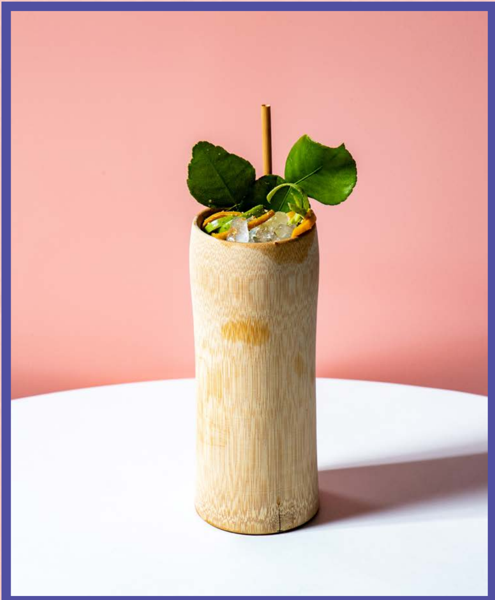
TREETOP SPIRITZ — 220฿ Mango Juice, Lime, Honey, Soda Water