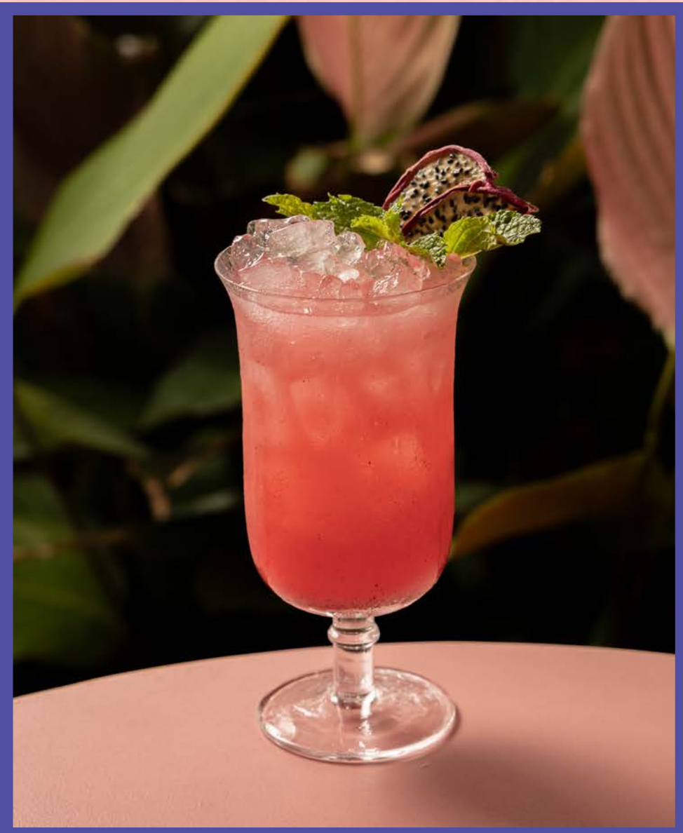
LAST BREATH — 450฿ White and Dark Rum, Dragon Fruit Puree, Dragon Fruit Syrup, Watermelon Juice, Lime, Sugar