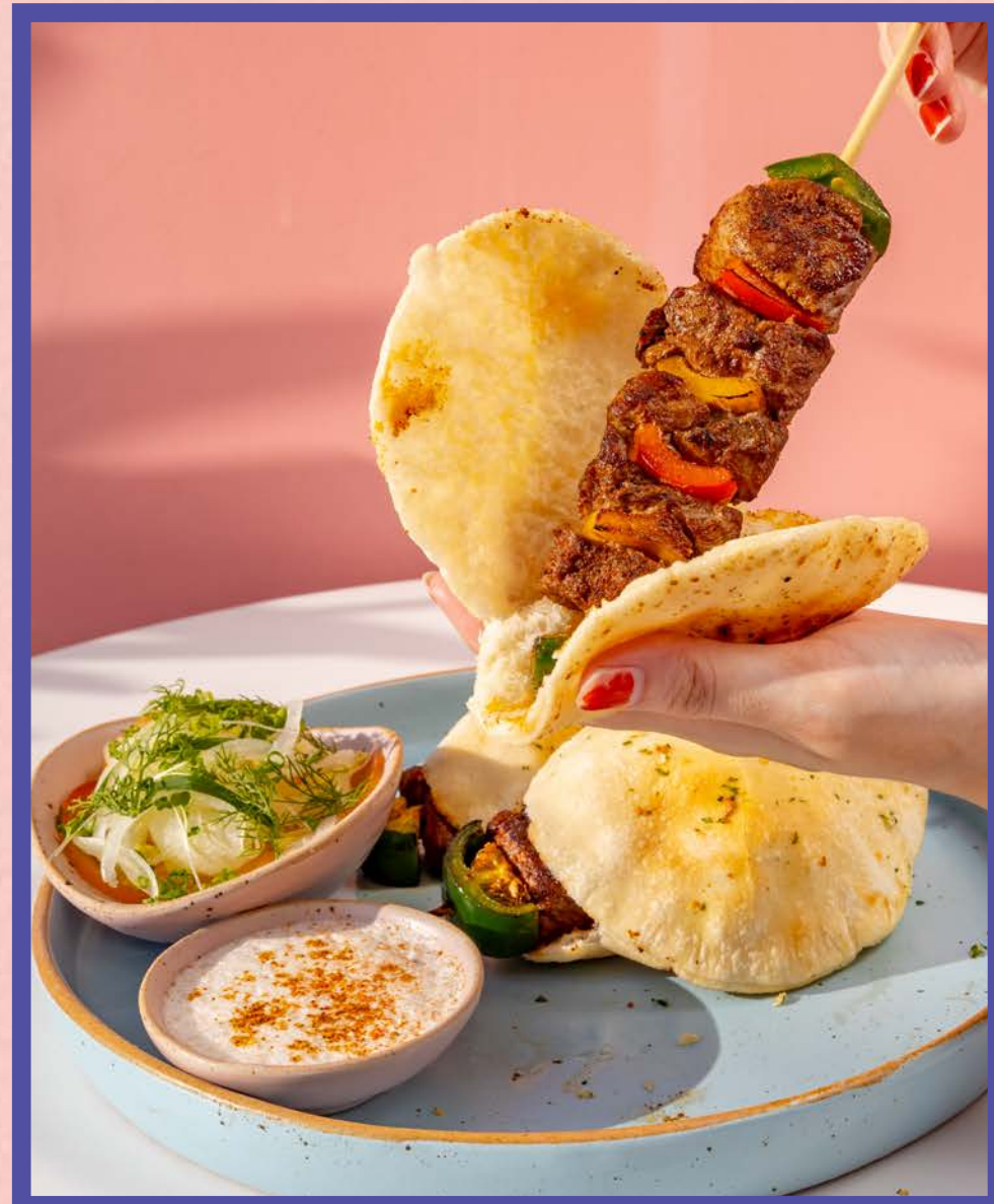
SKEWER KEBAB — 990฿ 🌿 🥚 Lamb Marinated in Mild Spices Mixed, Capsicum, Fresh Salad, Pita Buns, Yoghurt Sauce

DIETARY RESTRICTIONS 🌿 NUT 🌿 GLUTEN 🥚 DAIRY 🦞 SEAFOOD