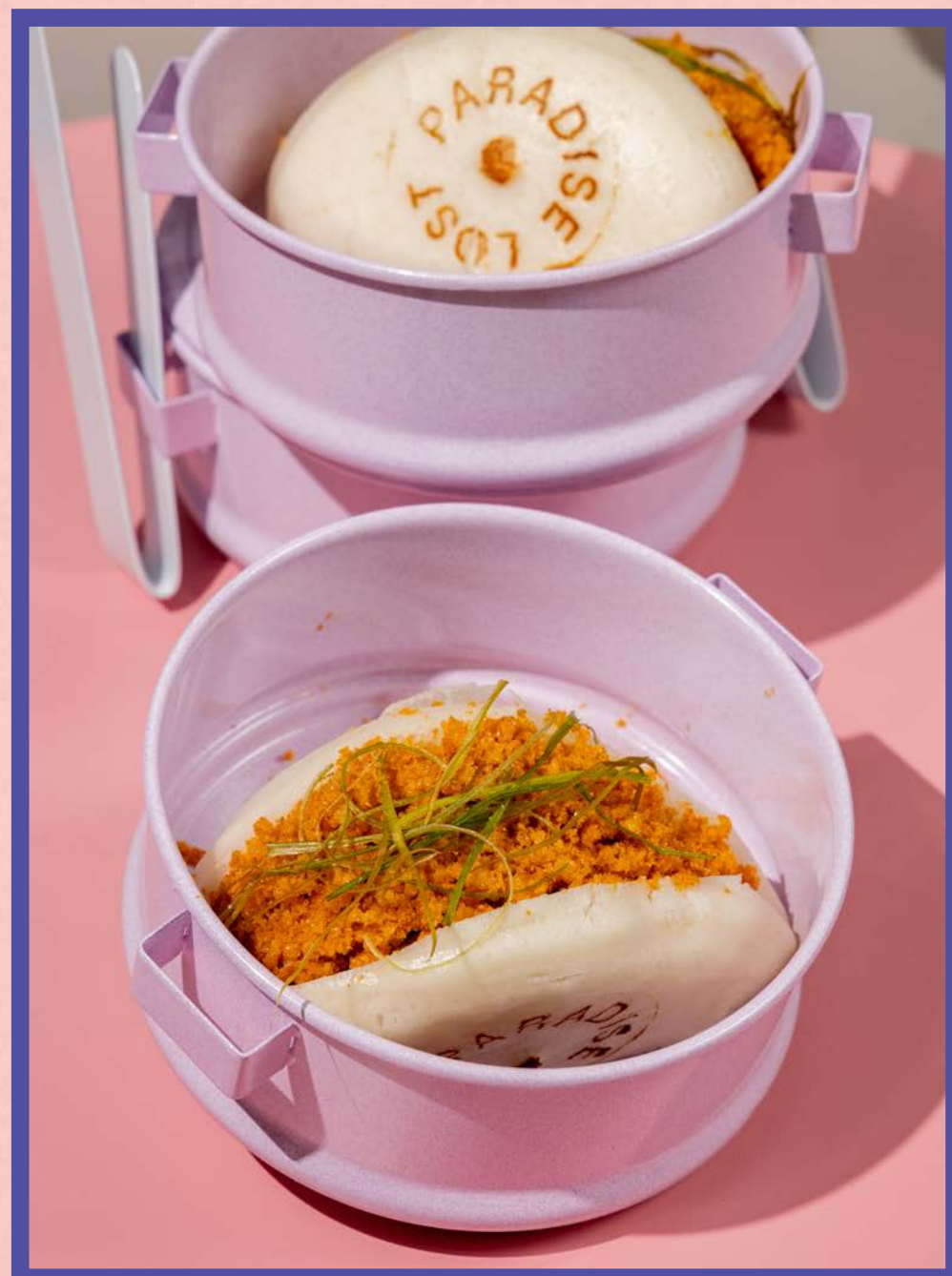
PORK CONFIT BAO — 390฿ 🌿 🥚 Pulled Pork Barbecue, Confit and Crispy Leeks, Peanut Butter