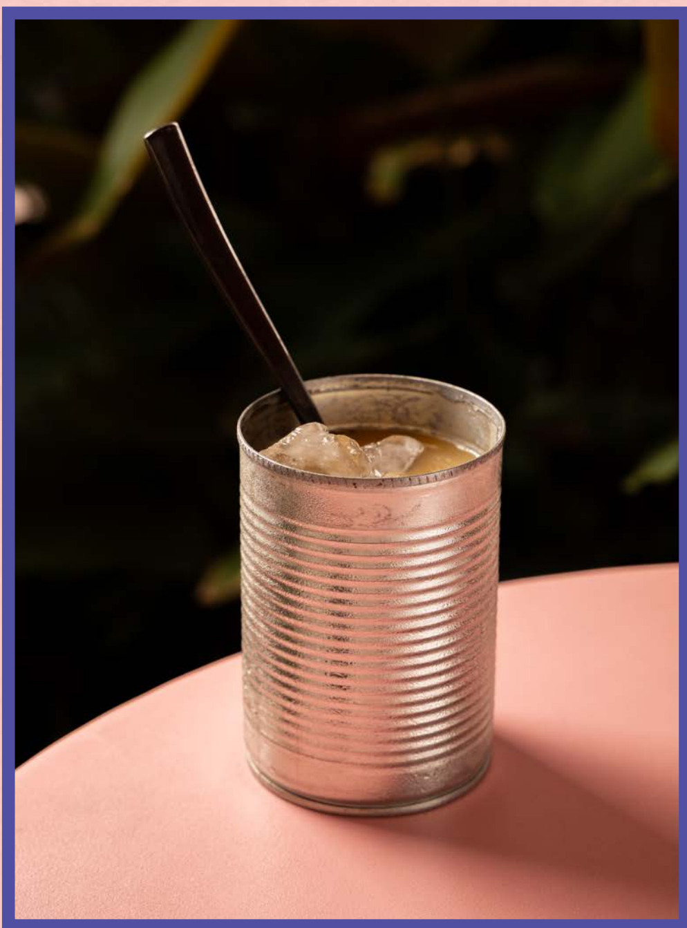
PREP FOR SURVIVAL — 400฿ Vodka Fat Washed, Vegetable Juice, Brown Beans Soup