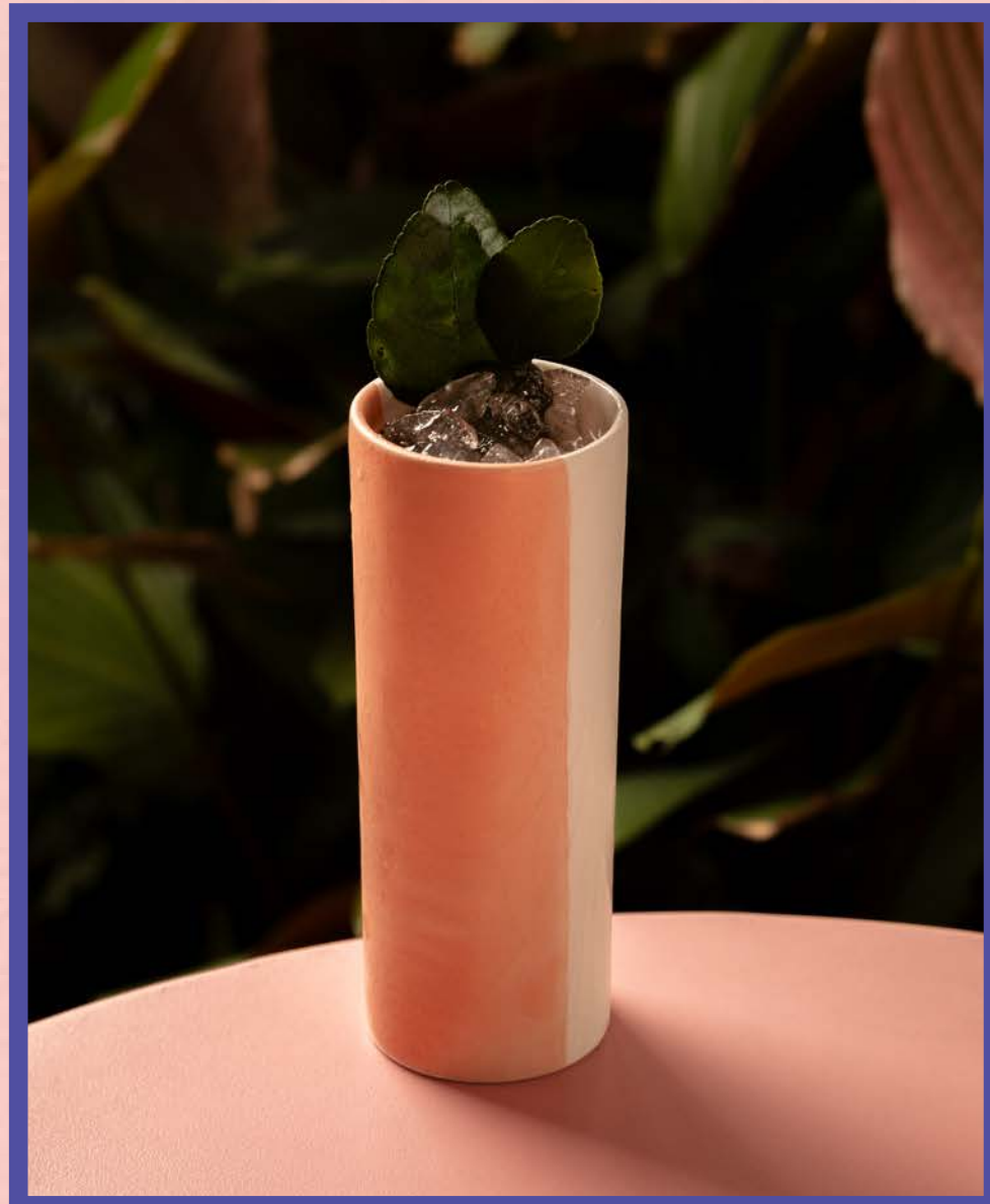
TROPICAL — 220฿ Infusion (Lemongrass, Kaffir Lime, Pineapple Peels), Lime, Watermelon Syrup, Soda Water