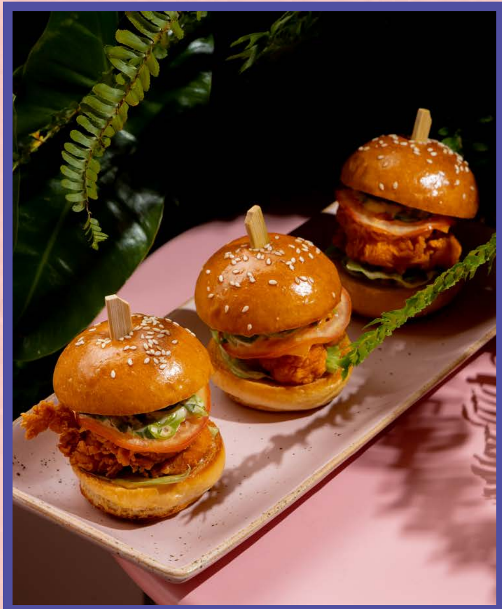
MINI ZINGER BURGER — 590฿ 🌿 🥚 Buns, Fried Chicken, Spicy Mustard Sauce