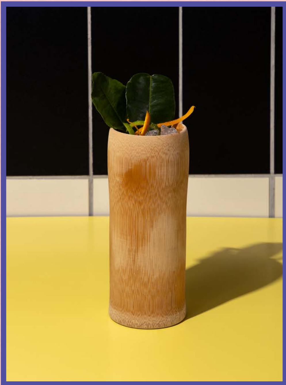
THIRST AIDE KIT — 180฿ Lemongrass Water, Kaffir Lime Juice, Ginger, Lime, Soda