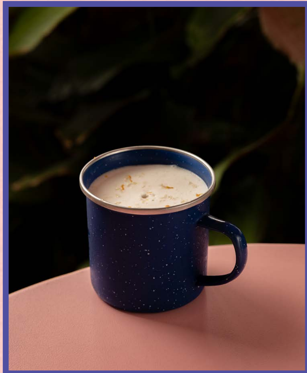
J.A.F.E — 510฿ Vodka, Kahlua, Frangelico, Triple Sec, Coffee, Agave Nectar