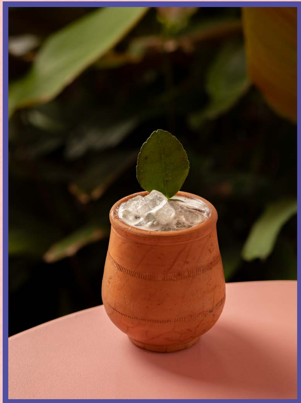
TANGIER — 400฿ Cachaça, Tangerine Syrup, Orange Juice, Lime, Tangerine Peel & Bitter