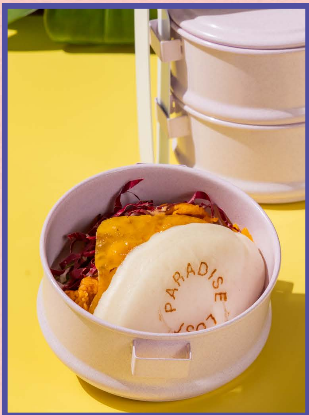
CHICKEN BAO — 390฿ 🌿 Deep Fried Chicken, Cheddar, Chipotle Sauce