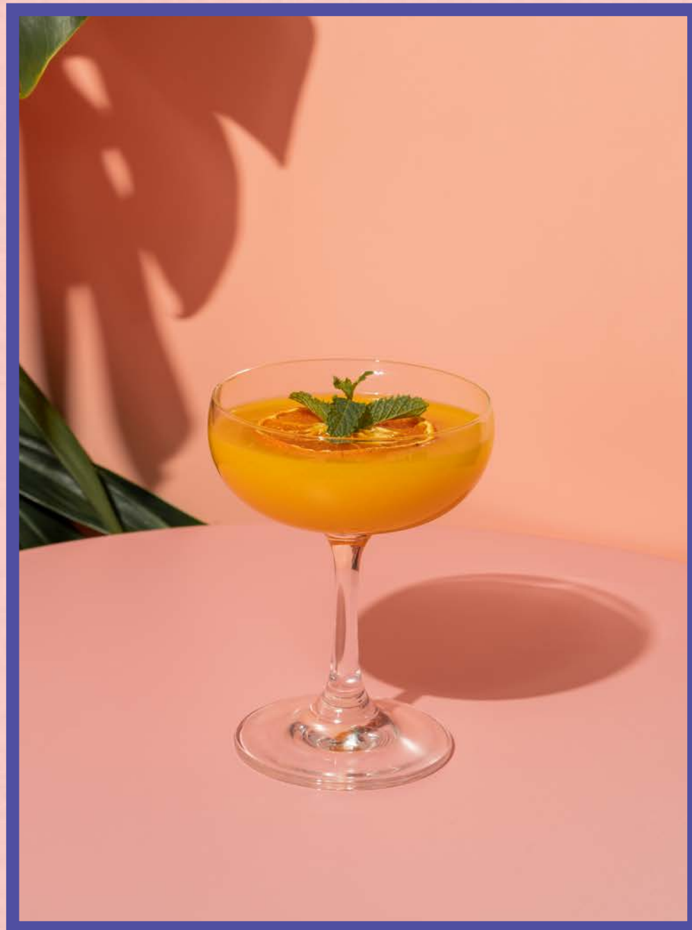
FEARLESS HOOPOE — 120฿ Rooibos Red Tea, Passionfruit-Mint, Aquafaba, Lemon