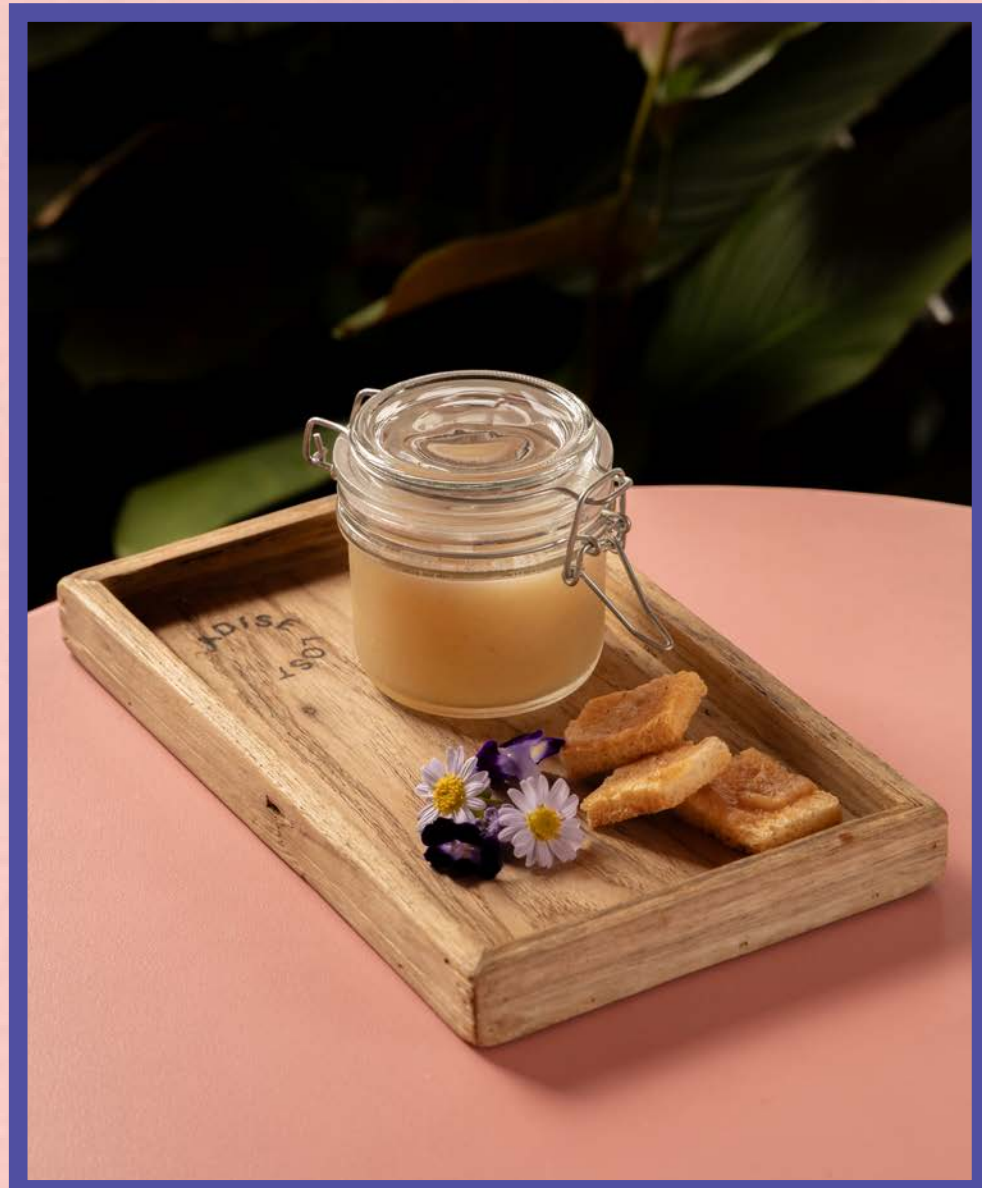
BREAKFAST IN PARIS — 460฿ Brandy, Seasonal Jam, Lime, Triple Sec